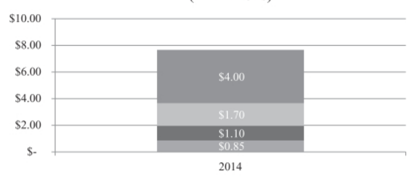
■ Base Salary ■ Annual Incentive Earned ■ LTI Award ■ Recruitment Award